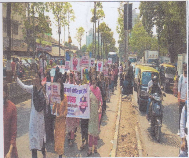
On 8 th March 2022, Women's Day, students participated in rally organized by RAK police station.